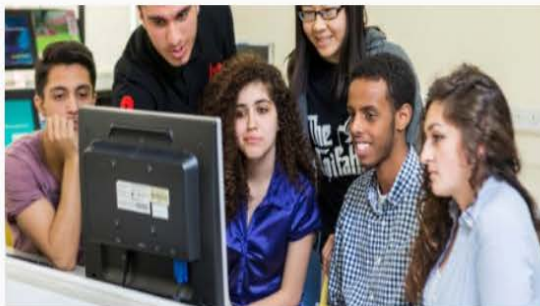
SURVEY FOR YOUNG ADULT CAREERS