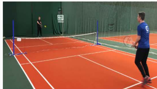
THURSDAY AFTERNOON FUN