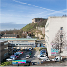
1 MAID MARIAN WAY