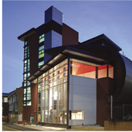
2 HIGH PAVEMENT